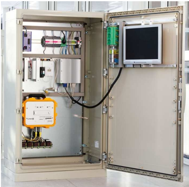
Control cabinet with DMT SUMMIT M Hydra digitizer.