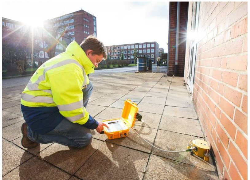
SUMMIT M Vipa with 3-component sensor.